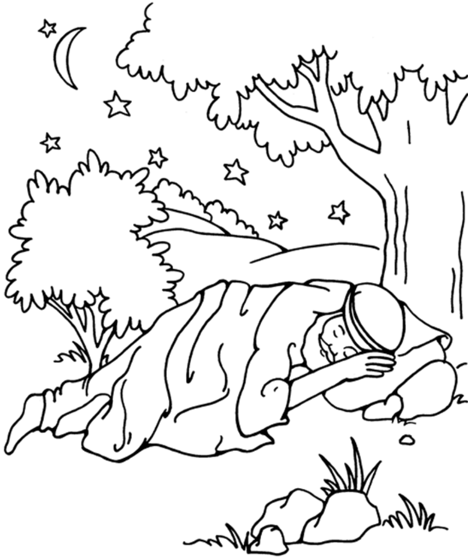
God Cares for Jacob

From Thru-the-Bible Coloring Pages for Ages 4-8. © 1986, 1988 Standard Publishing. Used by permission. Reproducible Coloring Books may be purchased from Standard Publishing, www.standardpub.com , 1-800-543-1301.